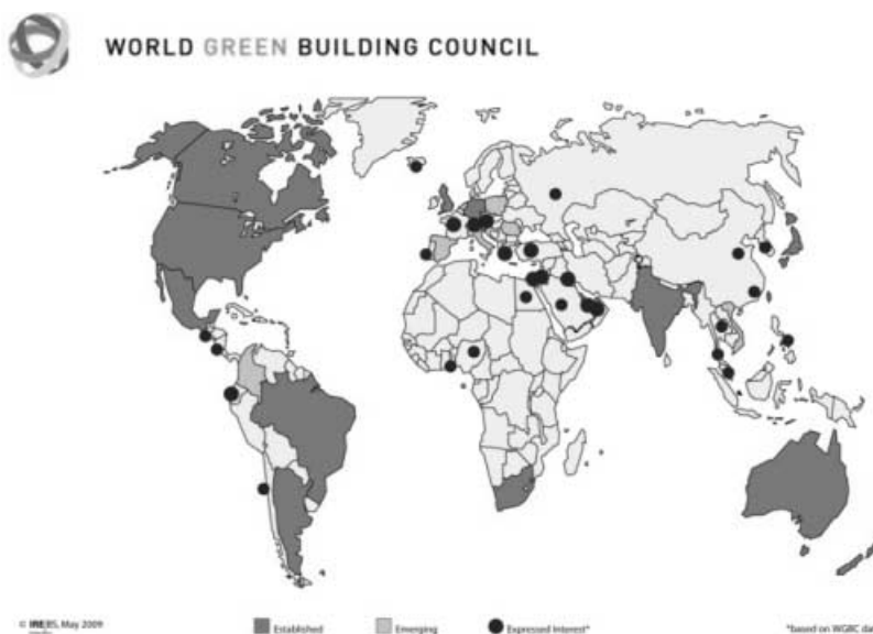
Exhibit 4 | Countries with Various Rating Tool Development Levels

While there has been fragmentation of rating systems as shown in Exhibit 1, it can be argued that the World Green Building Council has the largest global