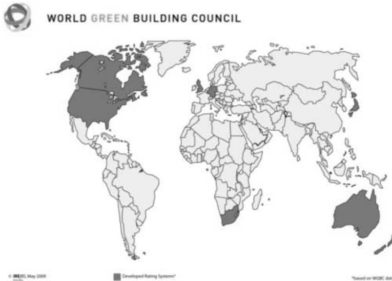
Exhibit 6 | Countries with Rating Tools only Accepted by WGBC

the Royal Institution of Chartered Surveyors (RICS), adopted sustainability policy principles with the “intention to place sustainability at the heart of all its activities,” (RICS, 2007). Not only do built environment professionals need to learn the rationale for sustainable development and to appreciate the key issues, they need to learn how and when to apply the many environmental assessment tools.