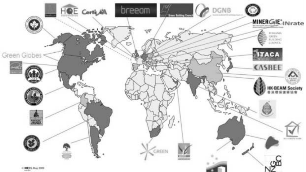
Exhibit 1 | Complex System of International Rating Tools

While it is possible to directly compare the value of an office building in New York City, Berlin, London or Melbourne using a ten-year discounted cashflow approach (after allowing for exchange rate variations), making a similar direct comparison of the sustainable features and rating of the same building is quite complex. In the past it appears there has been an unwillingness to compromise or admit a particular rating system may not be the possible best tool, which in turn has been a barrier to developing a global rating system (Exhibit 2). The unwillingness to compromise or admit that a rating system may be deficient in certain areas may be due to a lack of knowledge and understanding on the part of those valuing or marketing buildings. A starting point is to reflect on the current development status of rating tools internationally (Exhibit 3). It can be noted that most countries with existing or emerging rating tools have developed economies